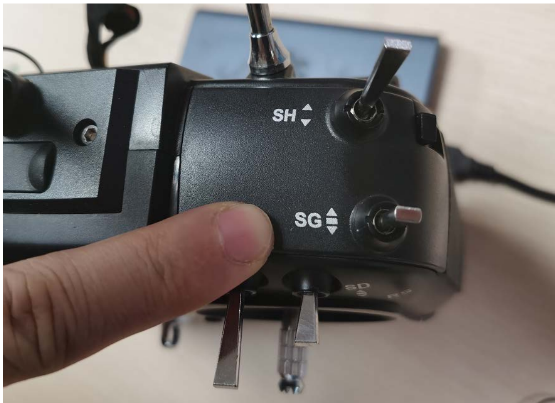
The switcher should be at middle at default, if you pull it up, it triggers the recording, the blue light on the cam blink.